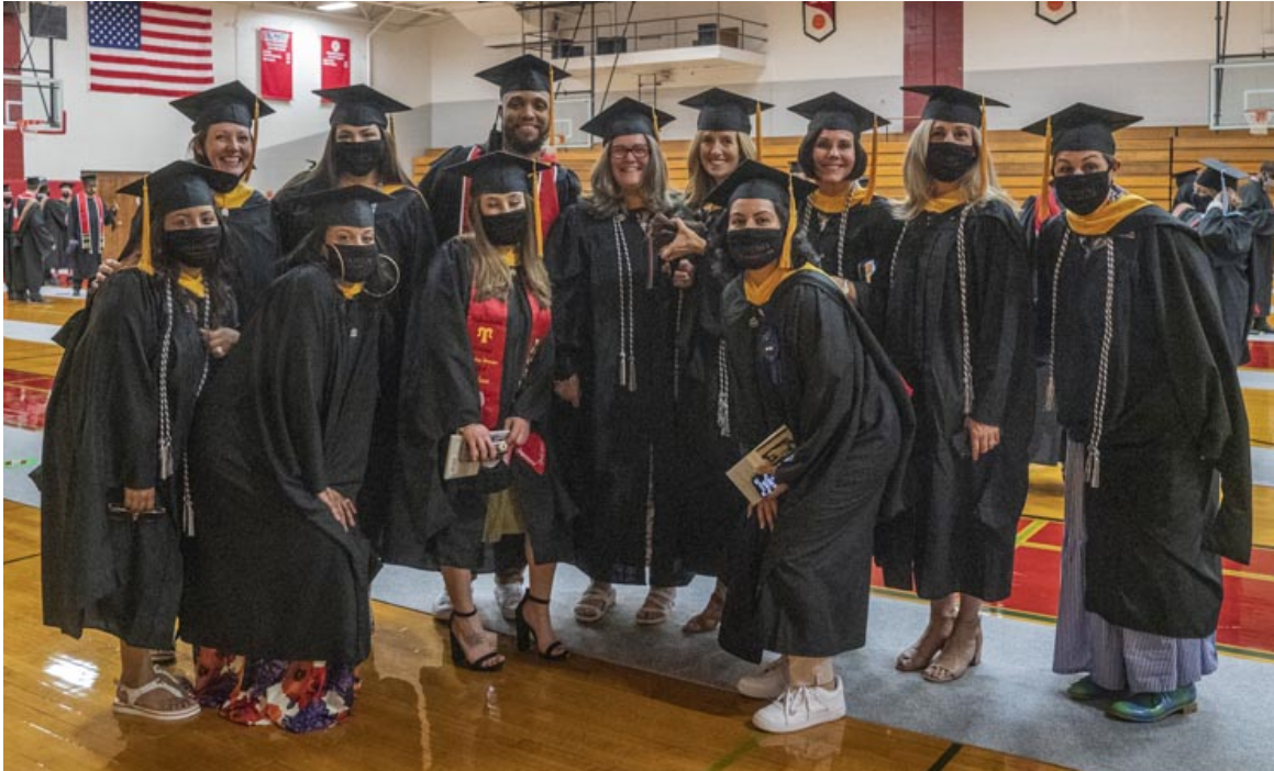
Picture: AGS Graduates, May 2020

Three times a year - December, May, and August - cohorts of students from ENC's Adult & Graduates Studies Division complete their associates, bachelors, and masters degree programs. This August, we give a "shout out" to our newest August graduates! We are proud of your successes, grateful for your time with us, and wish you the very best in your next season of life!